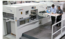
Finishing Services/ Die Cutting