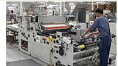
Windowing/Folding, Gluing & Packing